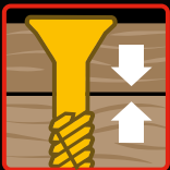
Dual Angle Thread Designed For Superior Hold

For: Wood | Man-Made Board | Thin Metal | Plastic