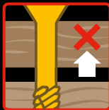
Partially Threaded Stops The Timber Jacking