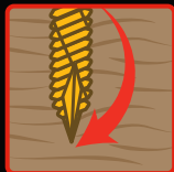
Rapid Drive Twist Cut Enhances Drive Performance