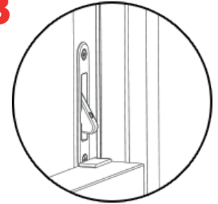
Lower bottom sash. Opening control device resets

To manually re-engage window opening control device