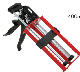
400ml Extrusion Tool

Once the damaged, decayed and discoloured wood has been removed by use of a suitable cutter tool such as a router or chisel, then the area to be treated is lightly sanded to ensure excellent adhesion. The moisture content of the wood should be no greater than 18% (check using a standard moisture meter) and damp wood should be allowed to dry naturally, or by way of a hot air gun. The two components are mixed manually into a separate container, and thoroughly agitated for one minute. The 2:1 mixing ratio should be strictly observed. EWS should be applied directly onto bare wood in the repair area using a standard brush and then left to cure for 20 minutes, prior to carrying out the repair. The repair can then be applied when the EWS is wet or fully cured. Please refer directly to the Timbabuild® EWS data sheet for more details.