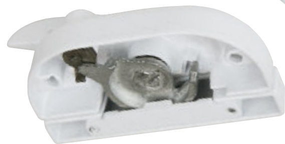
Cam engaged in the keep