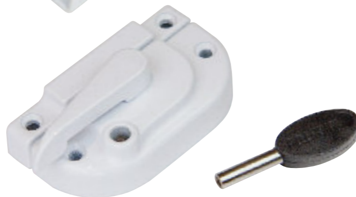
Streamlined design with key

Each and every one of your customers will benefit from your expert advice on window security. And by using Mighton Securibead™ & SBD Kit™ you are giving yourself the opportunity of being accredited for Secured by Design certification. Mighton will guide you through the process of registration.